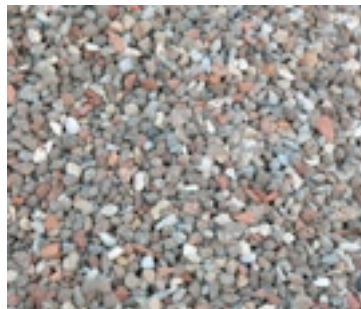
10mm Aggregate $24.00 / tonne