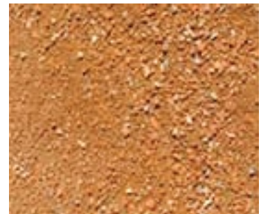
Crusher Sand - 6mm Bedding Sand $15.00 / tonne