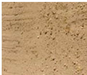
Soil Blend Turf Underlay Screened $18.00 / tonne