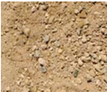
20mm Minus Crushed Concrete $18.00 / tonne