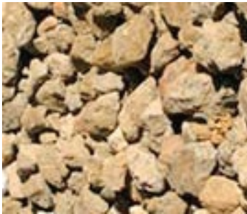
40 - 70mm Aggregate Concrete Price on Application

We have a large range of recycled products available from our Clarendon or South Windsor yard. Below is a list of the products we offer with the price per tonne. Please call to confirm availability of products. Other products and discounts for bulk orders are available, please call for a quote and ask about delivery rates or as required.