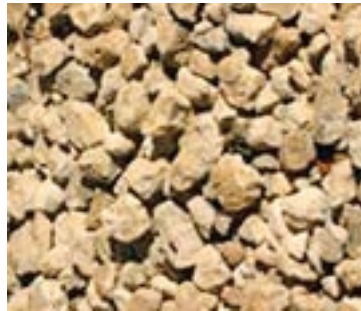
30 - 40mm Aggregate $20.00 / tonne