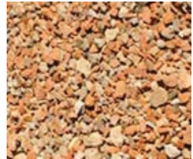
20mm - 30mm Aggregate $20.00 / tonne